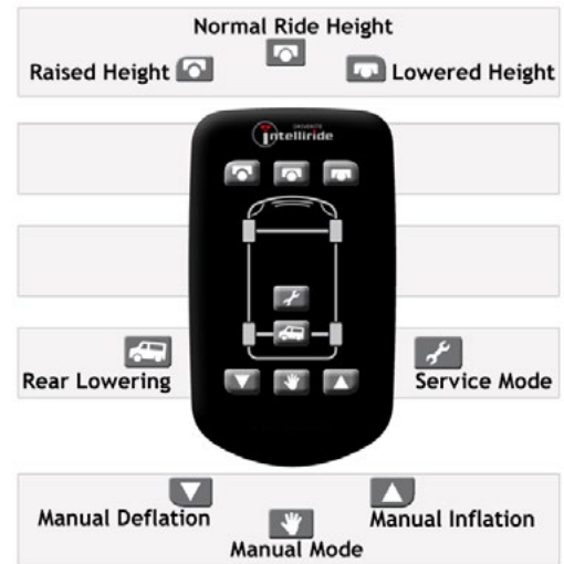
Handheld Controller The Drive-Rite 2 Corner Handheld