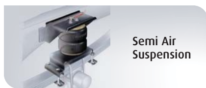
Semi Air Suspension

Drive-Rite air helper springs can be installed on most light commercial vehicles, motorhomes, vans and SUVs. Systems available for both leaf and coil spring applications. The double convoluted and tapered sleeve air springs offer comfort, maximum load support as well as years of worry-free service under any load condition.